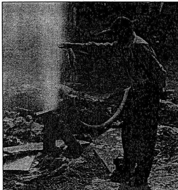
A member; of the medical center, maintenance staff inspects the yield of a new bore hole before it is capped and connected to piping. .'