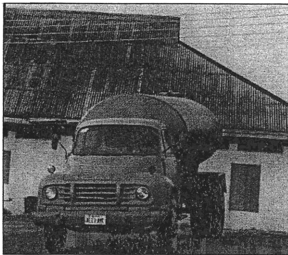
NO LONGER NEEDED! This tank truck was formerly used to haul water that had to be purchased from a vendor in Ogbomoso.